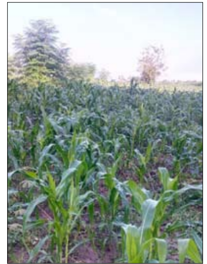
The resource for a mechanized borehole on the LBM Farm has been provided.