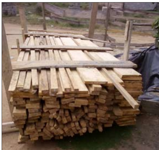
At left: The materials are ready to begin the building at M'Agya Fie.