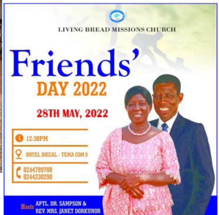
Right: In person at JOECARL Hotel in Tema or via Zoom (Join Zoom Meeting https://us02web.zoom.us/j/2535983633 Meeting ID: 253 598 3633) on Saturday, 28th May 2022 at 12.30pm GMT (Accra Time).