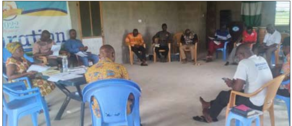
Heads and hearts together, seeking the Lord's guidance for the next 25 years, the missionaries met to pray and discuss the future.