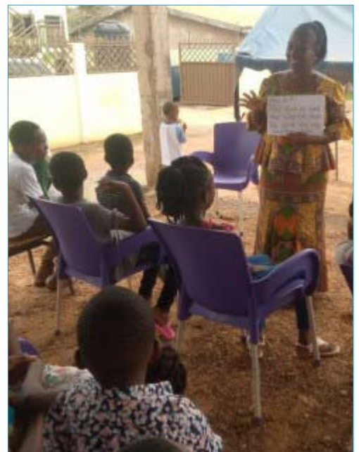
Above: Snapshots of Family Enrichment seminars.