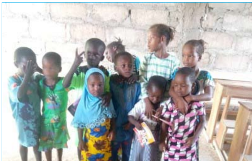
Below: Snapshots of children at the new Fulani school.