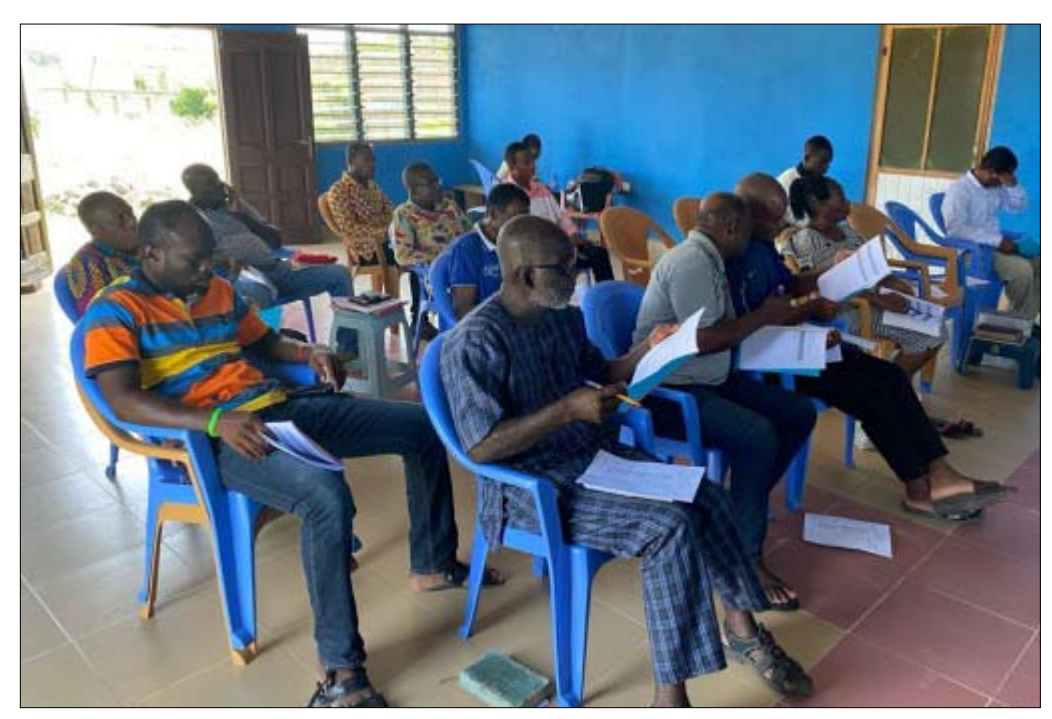
Ask me, and I will make the nations your inheritance, the ends of the earth your possession. Psalm 2:8

Through prayer and the Holy Spirit's leading, the leadership of LBM is trusting God for reaching more souls in 2024. The leaders met from the 16th to 20th October to pray and plan. Based on Psalm 2:8 we desire to take more territories for the Kingdom. Join us in prayer and come along with us in diverse ways to see God's Kingdom established on earth.