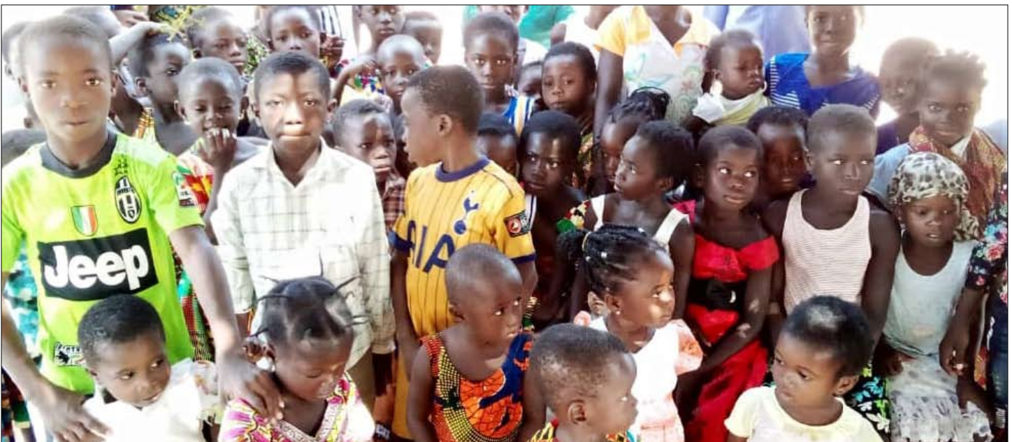
Chamba kids have already begun enjoying the Good News Clubs that grow from the GTTR training.