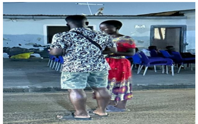
Persistent personal evangelism