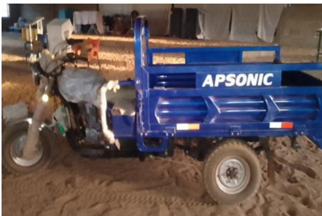
A tool for promoting the Gospel

We continue to move forward in spreading the Gospel of Jesus Christ to communities who need to hear. Thanks to our partnership fund, we've been able to provide a new tricycle to one of our Air Campaign Teams (ACTs) in the Upper East region. We give thanks to God and pray for this tool to effectively advance His Word.